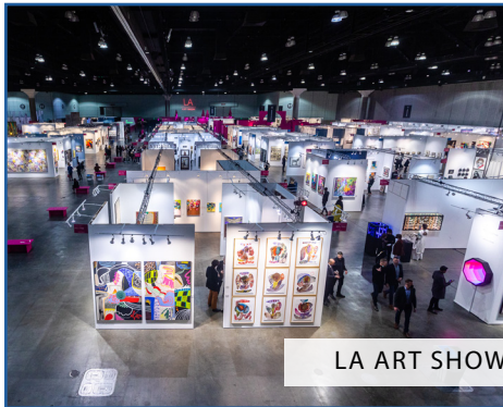
LA ART SHOW, JAN 19 - 23