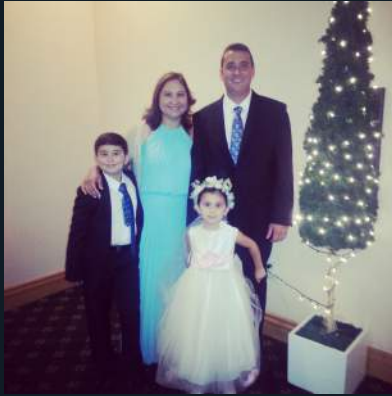
Position at LACC: Facilities Manager