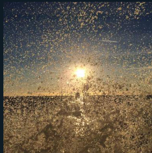
Boating in Santa Monica