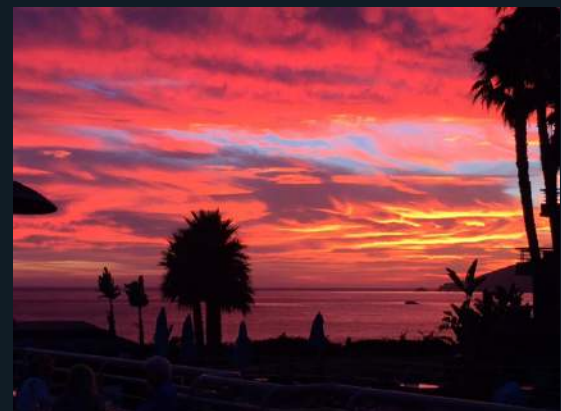
Pismo Beach, CA

Congrats Brad Gessner! October 2015 Photo Contest Winner