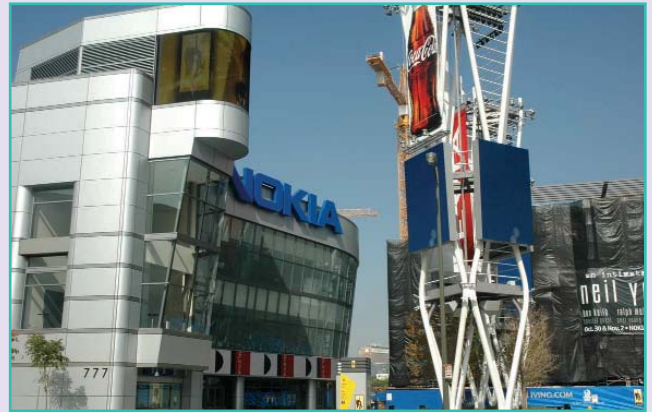
Recent rendering of L.A. Live development across from Convention Center.

L.A. Live is a reality, phase 1 has opened. On October 17th, the Nokia Theater hosted its ribbon cutting ceremony in the early morning with many sports and political celebrities accompanying L.A. Live, Staples Center, and Los Angeles Convention Center executives.