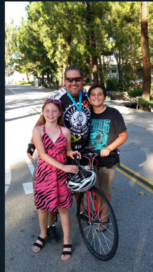
Position at LACC: Parking Manager