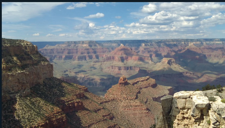
Grand Canyon, AZ